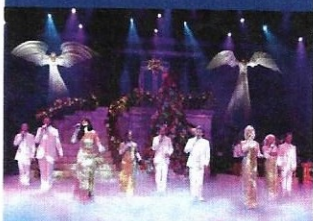
The Christmas Show at the Alabama Theatre