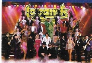
Exciting Legends in Concert