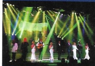
Fabulous Carolina Opry Christmas Show